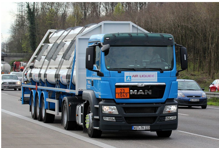
Figure 3 Typical gaseous tube trailer [Air Liquide]