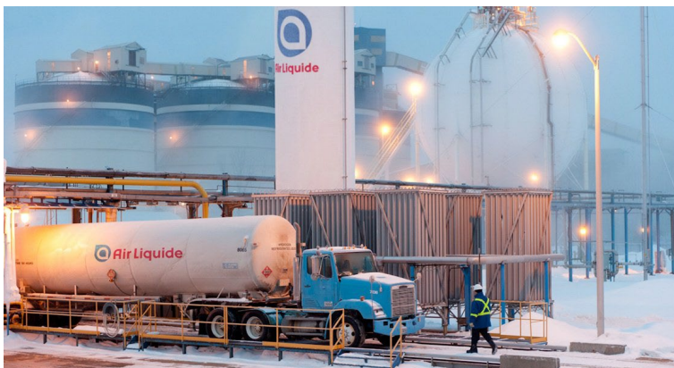
Figure 4 Typical cryogenic liquid tanker truck