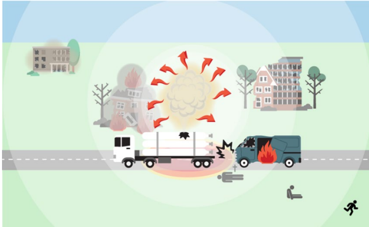
Figure 2. Hydrogen transport and collision